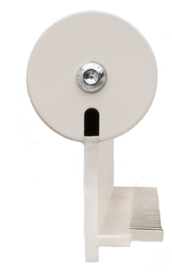
Otolift Air Ø 6 CM in real size