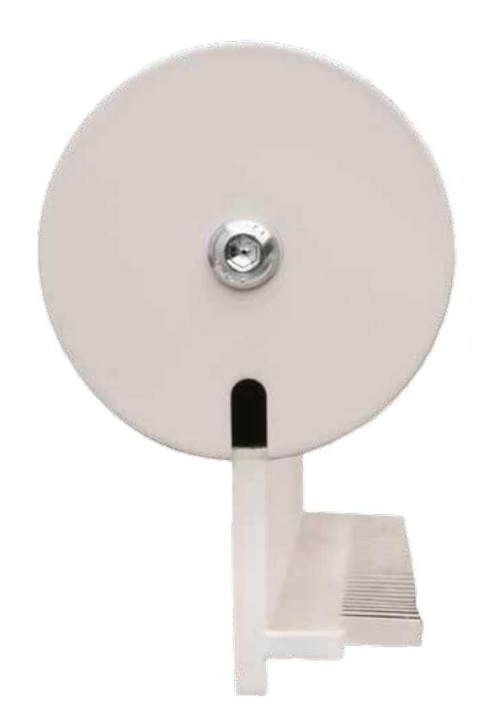
Otolift One (predecessor) Ø 8 cm in real size

This makes it particularly clear: the predecessor (Otolift One) and the new rail system of the Otolift Air next to each other.