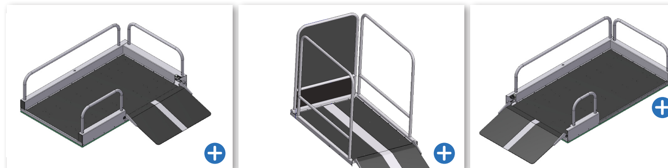
Side Access On Lower Landing