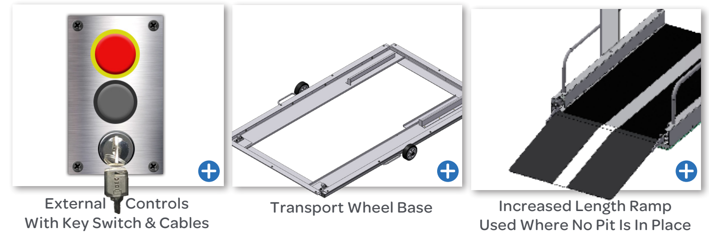
External Controls With Key Switch & Cables