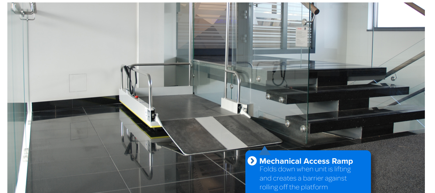
Mechanical Access Ramp Folds down when unit is lifting and creates a barrier against rolling off the platform