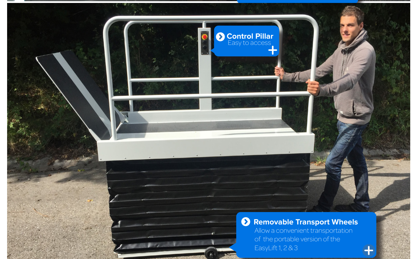
Control Pillar Easy to access