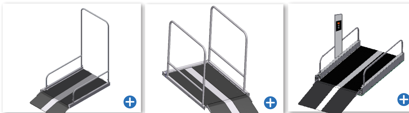
Safety Bar In Upper Landings (1780mm)